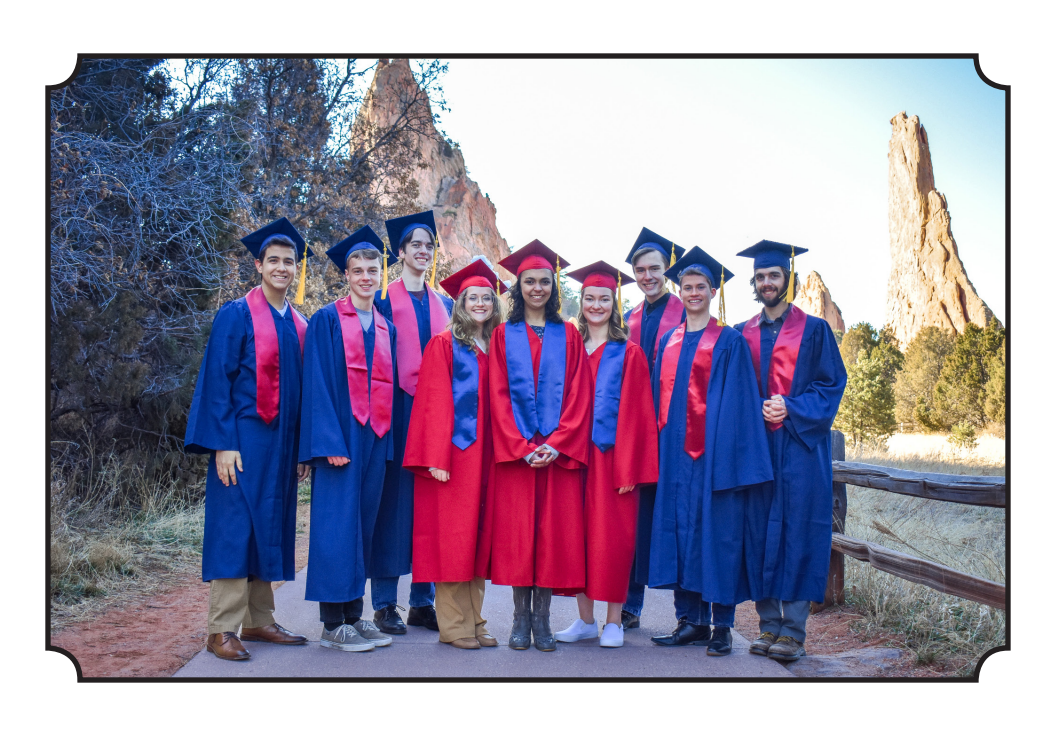
Class of 2024